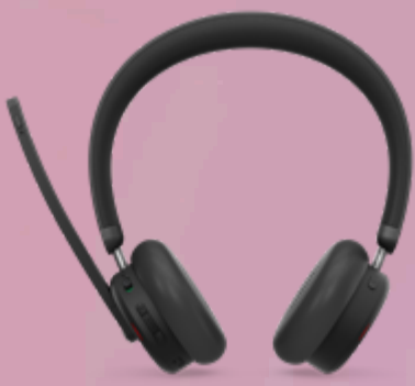
Lenovo Dual-Mode Wireless ANC Headset 6550 (USB-C, Teams) 4XD1S19778